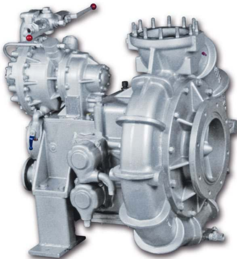
picture showing high pressure part as well